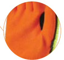
Nitrile coated palm