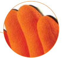
Touchscreen capability (2022 Q3) using conductive elements