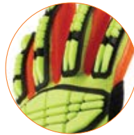
Thermoplastic sewn on